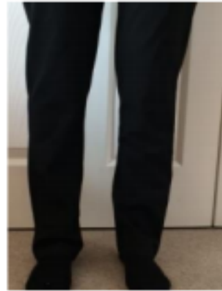
Straight – acceptable