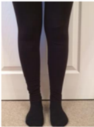
Skinny fit – not acceptable