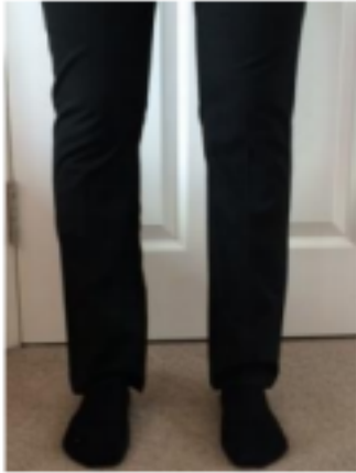
Slim fit - acceptable