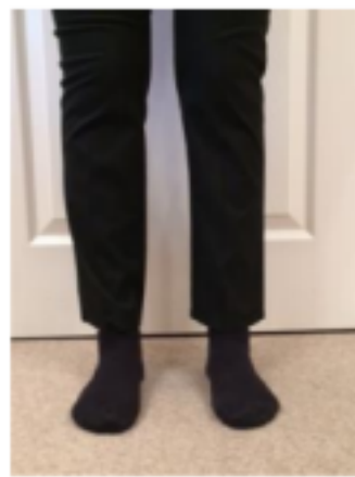
Not full length – not acceptable